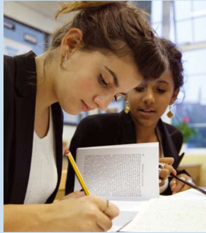
Preparing for the public examinations